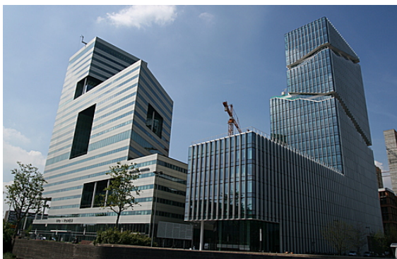
Figure 2. Photograph of the real situation of case of type 2 (building on the right side)

An example of a complex, multi-level property situation (type 2) is the creation of two 3D property rights for a building (an office tower) on one hand and the underground parking under it on the other hand. The example given is located at the South-axis business district of Amsterdam (Figure 2). The foundation piles of the office tower are situated in the underground parking. For both constructions long leaseholds have been established by the land owner, the municipality of Amsterdam. As land owner the municipality retains all rights on the public space on the roof of the parking that is not occupied by the office tower; as near the entrance of the building (shown in Figure 2).