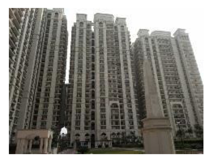
Fig. 2. High rise flats built in Kirti Nagar, Delhi; Source: Magicbricks, 2019.

Dwarka and Kirti Nagar being houses (Fig. 2). This type of high rise development is happening all over the urban area. Different types of utility networks, owned or managed by various agencies, have occupied the space under, on and above the surface of the city. Ghawana et al., 2013 provided an insight to the overlapping rights situation using a specific and detailed case study of utility networks on the Dhaula Kuan traffic point; one of Delhi's busiest traffic points (Fig. 3).