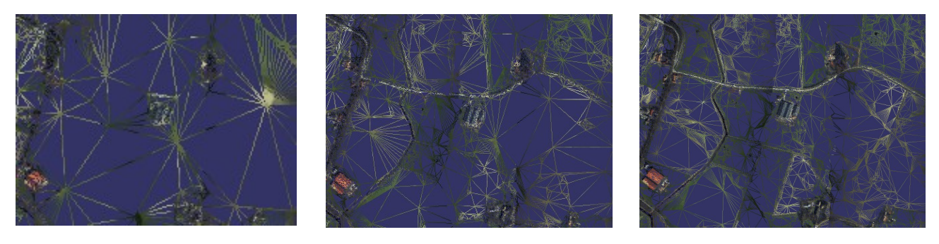
Illustration 2: Different levels-of-detail visible in the wireframe of the TIN terrain model

high-quality imagery was in the ESRI ECW format, but did not contain any geo-referencing and was not used in the final result.