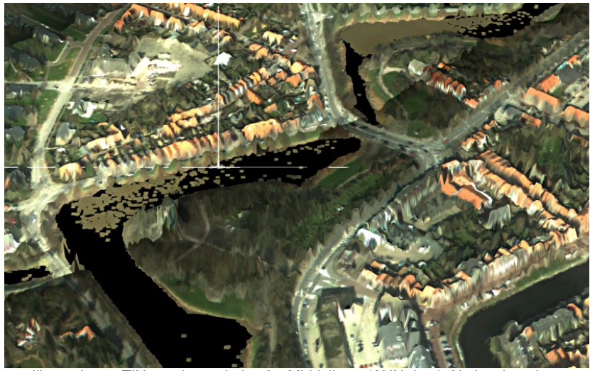
Illustration 3: TIN terrain rendering for Middelburg (AHN data). Notice that sharp features (e,g, buildings,trees) are not well captured by the TIN.

The resulting terrain model can be loaded directly in any OSG model viewer or our specialized, VRMeer based terrain viewer. The visual quality differs with the distance the viewer takes to the landscape, and the spatial frequency of landscape features. When using a DEM without filtering, buildings appear to be "draped" with a sheet. It must also be stated that the low color quality of the raw RGB textures hindered a consistent appearance. A consistent framerate of 60 frames per second is achievable during exploration, without disturbing artifacts when loading in different levels of detail.