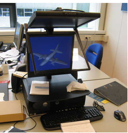
Illustration 1: The PLANAR display

To get a correct stereo image from graphics software, one can either adjust the software for stereo viewing or let a stereo driver provide emulated stereo for general 3D application. Provided installation instructions for the system were not compatible with recent video