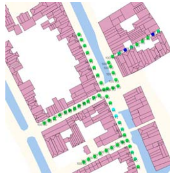
Figure 3: Combined Galileo and GPS: positioning in narrow streets is possible (only two dark dots remain undetermined)

thus a large investment. The urban areas are again problematic. A mobile phone can be easily connected to a transmitter (e.g. on a high building) that is 2-3 km far way from the current position of the user.