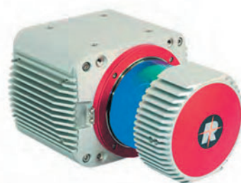
▲ Examples of small, lightweight Lidar sensors: South's Lidar SZT-V100, weight 1.5kg (left); Teledyne Optech's CL-360 OEM Lidar sensor released in 2019, weight 3.5kg (middle); the RIEGL VUX-1 UAV, weight 3.5kg (right).